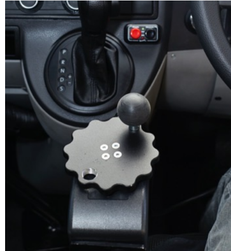
Mini Wheel Steering