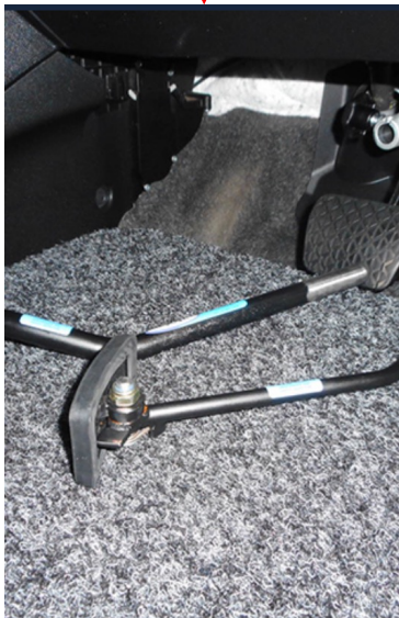
Quick Release Pedal Extensions