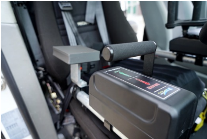
Freedom Brake & Accelerator