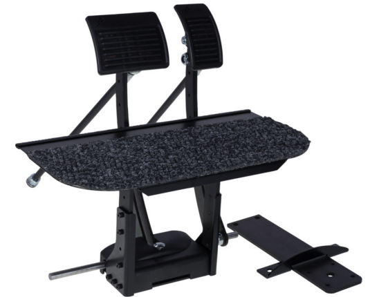
Menox Stamp Pedal Extension