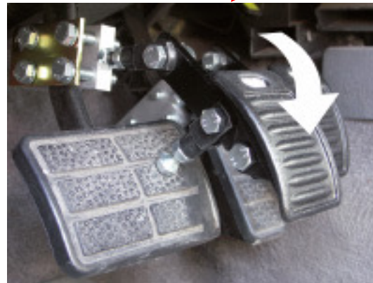
Menox Mini-stamp Pedal